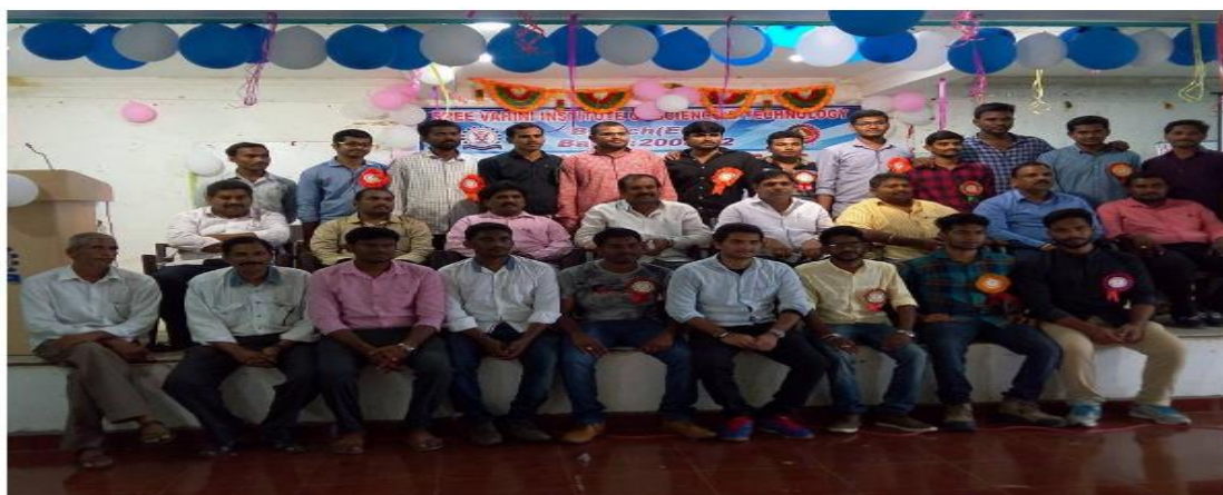
ALUMNI GROUP PHOTO